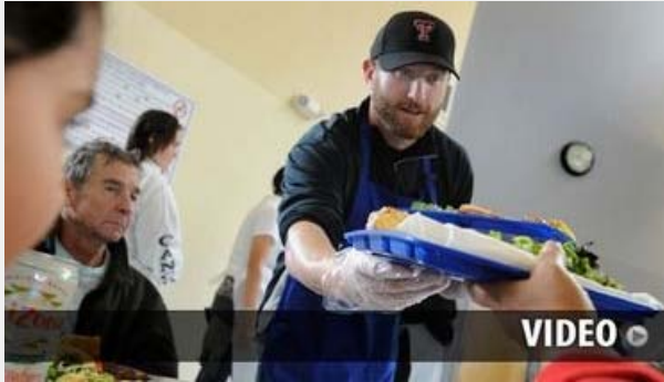
Stockton resident and Oakland pitcher Dallas Braden serves the lunch crowd at St Mary's Interfaith Dining Hall.